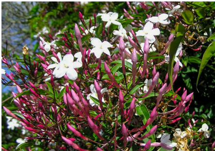
Jasmine Jasminum polyanthum