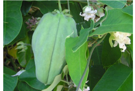
Moth Plant Araujia hortorum