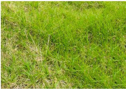
Kikuyu Grass Pennisetum clandestinum