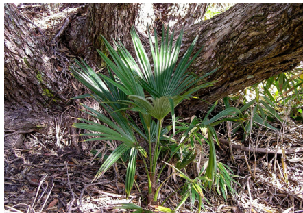
Chinese Windmill Palm Trachycarpus fortunei