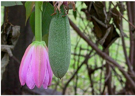
Banana Passionfruit Passiflora tripartita