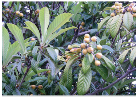
Loquat Eryobotria japonica