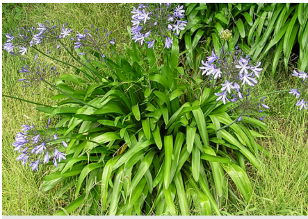
Agapanthus Agapanthus praecox