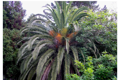
Phoenix Palm Phoenix canariensis