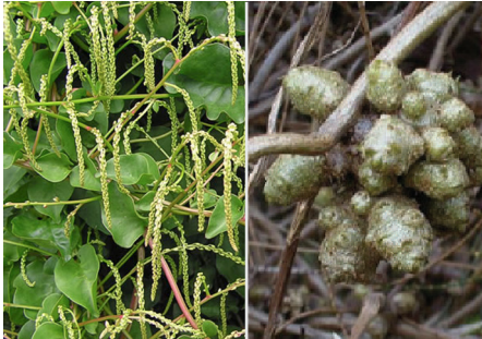
Madeira Vine Anredera cordifolia