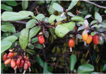
Elaeagnus Elaeagnus x reflexa