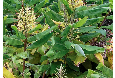
Ginger - Wild Hedychium gardnerianum