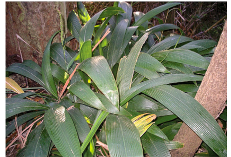
Palm Grass Setaria palmifolia