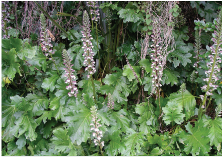
Bears Breeches Acanthus mollis