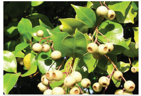
Monkey Apple Syzygium smithii (Acmena)