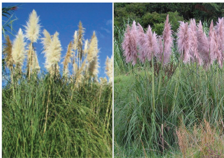
Pampas Grass Cortaderia selloana, C.jubata