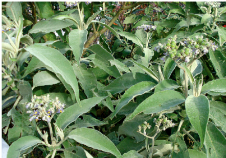
Woolly Nightshade Solanum mauritianum