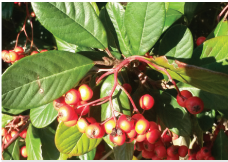
Cotoneaster Cotoneaster glaucophyllus