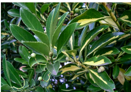
Japanese Spindleberry Euonymus japonicus