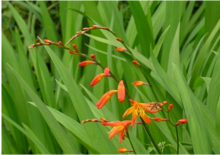
Montbretia Crococsmia X crocosmiiflora