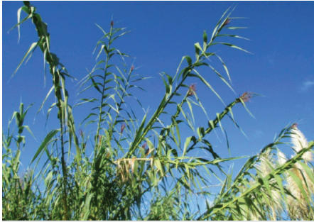
Giant Reed Arundo donax