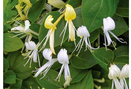
Japanese Honeysuckle Lonicera japonica