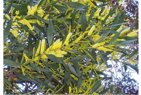
Wattle - Sydney Golden + Others Acacia species