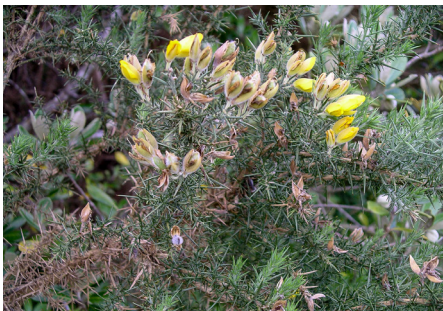
Gorse Ulex species