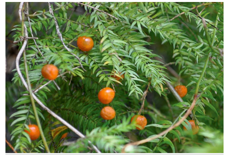
Climbing/Bushy Asparagus Asparagus scandens/asparagoides