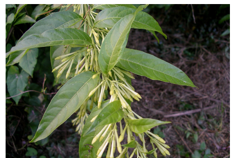
Queen of the Night Cestrum nocturnum