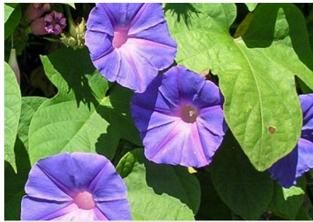
Blue Morning Glory Ipomoea indica