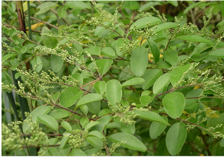
Privet - Chinese Ligustrum sinensis