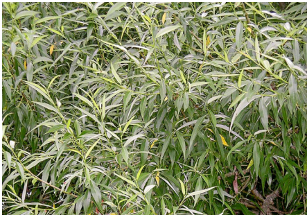
Willow - Crack, Grey Salix fragilis