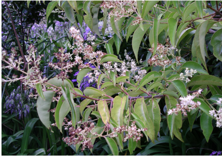
Privet - Tree Ligustrum lucidum