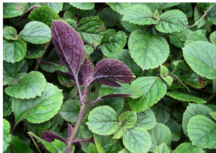
Plectranthus Plectranthus ciliatus