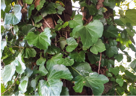
Ivy Hedera helix