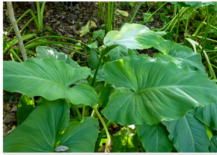
Arum Lily, Green Goddess Zantedeschia aethiopica