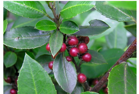
Evergreen Buckthorn Rhamnus alaternus