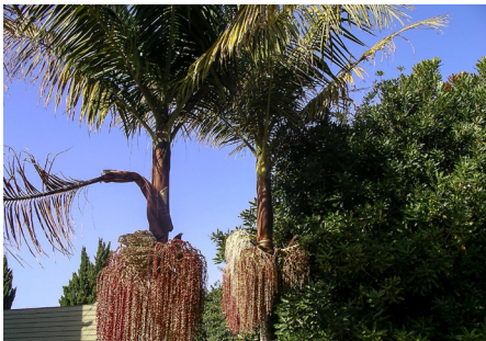
Bangalow Palm Archontophoenix cunninghamiana